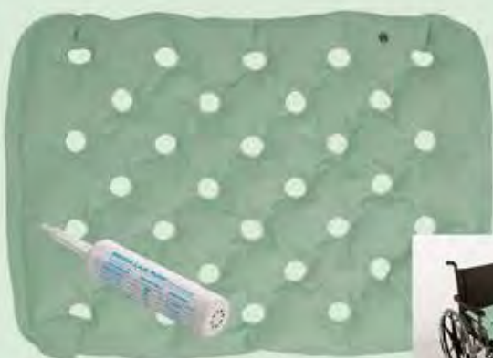
4250A Bariatric Cushion (LAD pump sold separately)